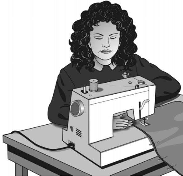
Kaupae Rautaki 8: Te Wāwāhi Tau Pānga Riterite

0.3 mita te roa o te papanga hei tuitui i tētahi hāte. Mēnā e 5.4 mita te roa o te papanga, e hia ngā hāte ka taea te tuitui?