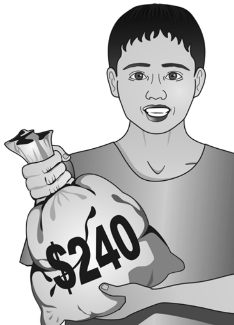
Kaupae Rautaki 8: Te Wāwāhi Tau Pānga Riterite